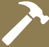
South Shields Transport Interchange