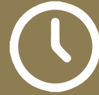
10 weeks (over 2 visits)

We were contracted by Morgan Sindall to construct the new metro rail station and associated platform, as part of the South Shields Transport Interchange project.